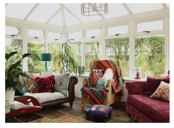
Feed back from our customers state they spent the majority of their home time enjoying their conservatory, making them a great lifestyle choice and investment.