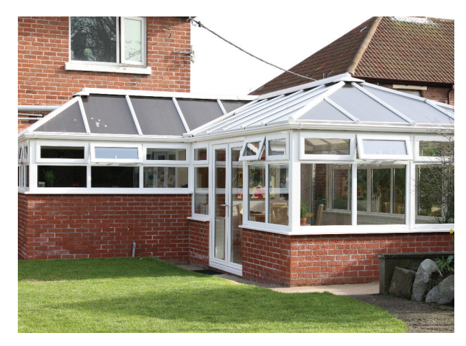
Two different wall heights in this one, the higher wall accommodates kitchen units.