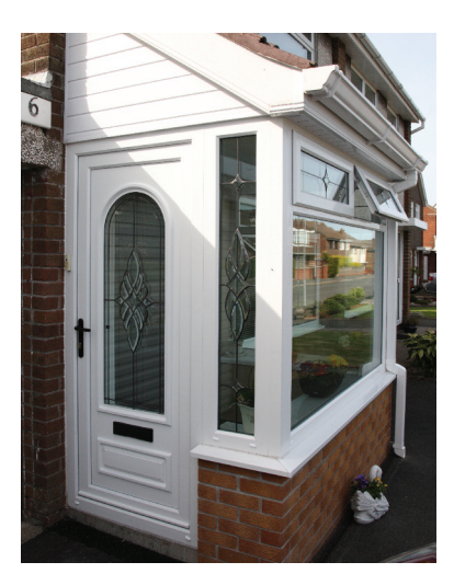
Similar to the one above only in white.