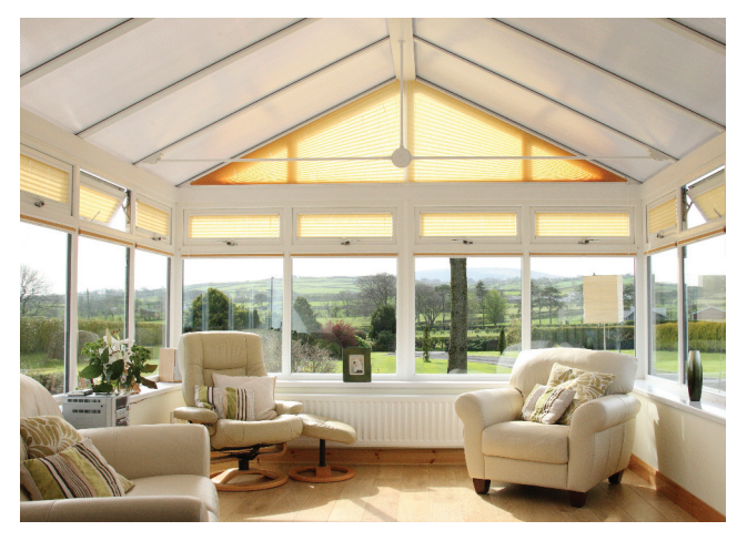
Leonard Swan and Sons conservatory bathed in light making the most of the Co. Antrim countryside.

Options include: solar control, tinted and self cleaning glass. All our conservatories are manufactured to British Board of Agreement (BBA) standards.