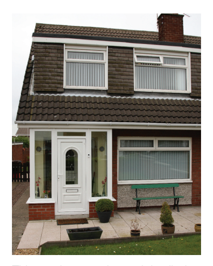
This porche uses the roof detail of the house, so it is cost effective.