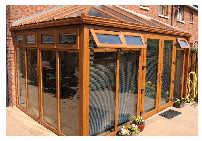
Light Oak Single Edwardian with frames to floor (and 35mm bronze polycarbonate in roof). Note: No sill to bottom of frames, frames overhang threshold by 5-7mm to create drip & cleaner lines.