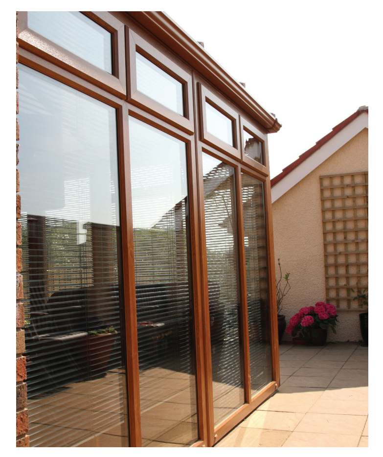
Although it doesnt look it there was approximately 10 tonne of spoil removed on this particular conservatory for foundation and insulated sandwich type floor.