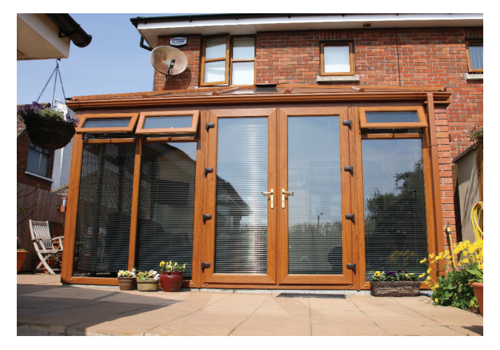
Technology in conservatory roof systems and frames make them a room for all year round.