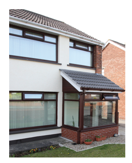
Woodgrain frames with white facia boards and mono pitched roof.