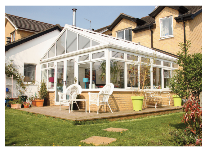
Gable fronted with finished brick. This conservatory connects the garage to the house.

Conservatories and sunrooms are part of our extensive range of PVCu products. Swans offer these products in a range of matching foiled colours , allowing you to co-ordinate the full exterior of your home to your specification. At Swan's we design and build conservatories to your specification.