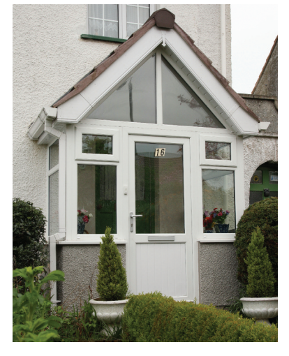
Tile roof with glazed gable front.