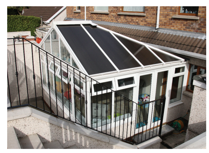
Approximately 120 tonnes of spoil removed to achieve this conservatory.